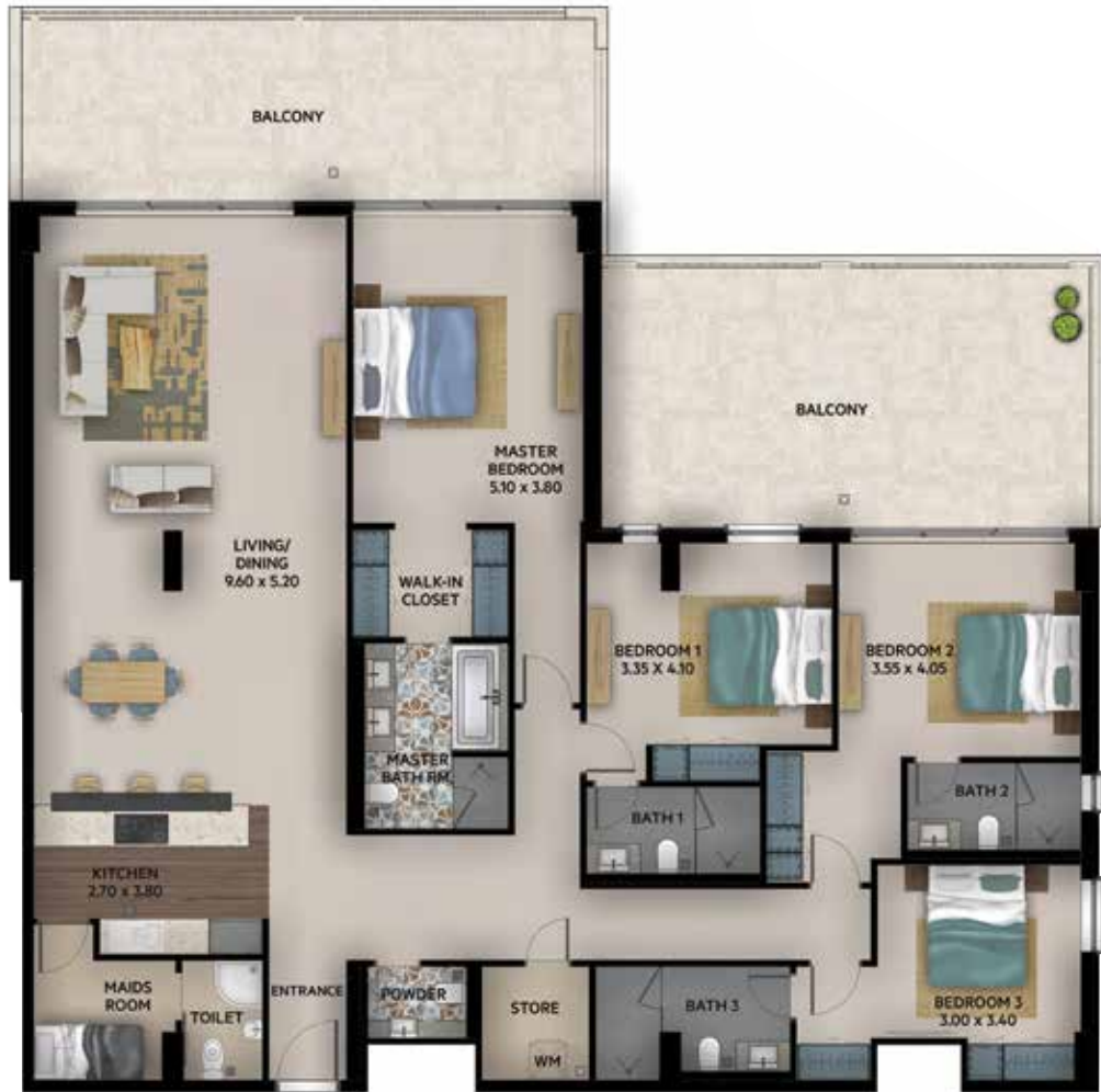
4 BEDROOM 1 MAID ROOM