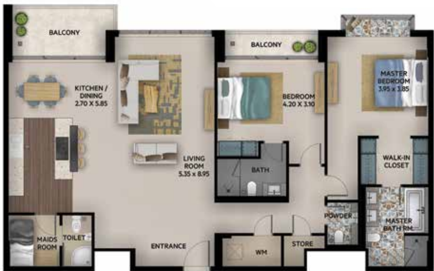
2 BEDROOM 1 MAID ROOM